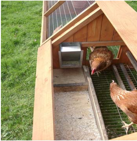
Access door removed, showing perch, wire floor, pop hole, nest and 1 Kg adjustable feeder, all easily removable.