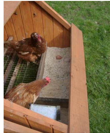
View of nest, showing easy access for collecting eggs.