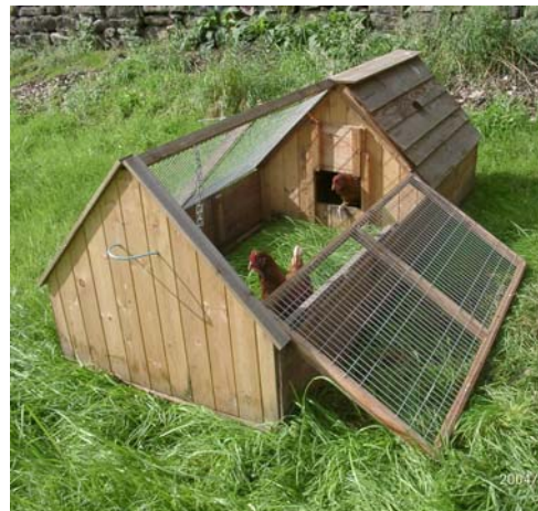
Hinged run door open allowing easy access. The door may be opened only a little, if preferred, to refill the drinker, or fully to let the birds range.