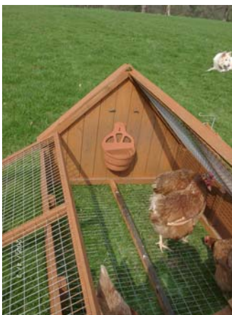
Plastic wall drinker.

OUR FOLD HOUSE IS PRICED @ £200 + £25 CARRIAGE + £39.38 VAT = £264.38